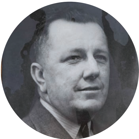
Capt. G.H. Frith Commissioner 1929 – 1931