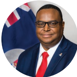
Hon. Juliana Y. O'Connor-Connolly , JP, MP