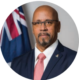
Hon. Bernie A. Bush , MP PACT Government Minister for Home Affairs, Youth, Sports, Culture & Heritage (HAYSCH) Elected Member for West Bay North