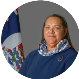
PACT Government Minister for Education, District Administration & Lands (EDAL) Elected Member for Cayman Brac East