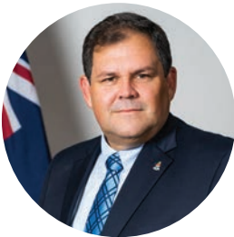
Hon. G. Wayne Panton , JP, MP Premier PACT Government Minister for Sustainability & Climate Resilience (MSCR) Elected Member for Newlands