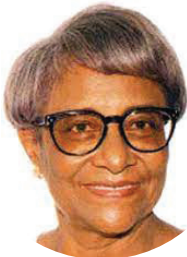
Hon. Sybil I. McLaughlin, MBE, JP National Hero 1959 – 1984