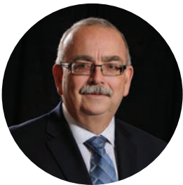
Hon. Roy M. McTaggart, JP, MP Leader of the Opposition

Opposition Member Elected Member for George Town East