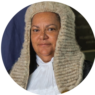
Hon. Juliana Y. O'Connor-Connolly, JP, MP 2002 – 2003 | 2013 – 2017